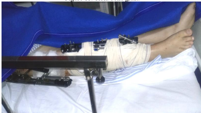
Figure 11: Tibia bone graft.

Patient in January 2019 bone graft was performed on the tibia for the process of lengthening and bone reconstruction.(Figure 11).