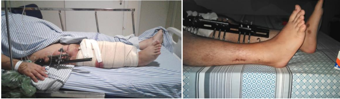
Figures 8 and 9: External fixator tibia.

Patient in February 2018 there was a need for placement of a second external fixator in the femur for continuity of lengthening and bone reconstruction leaving the patient with three fixators in his right lower MID (Figure 10).