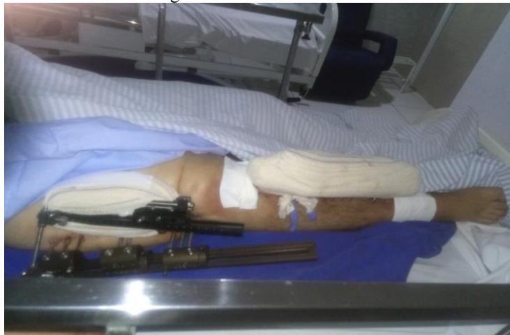
Figure 10: External fixators.

Patient in January 2019 bone graft was performed on the tibia for the process of lengthening and bone reconstruction.(Figure 11).