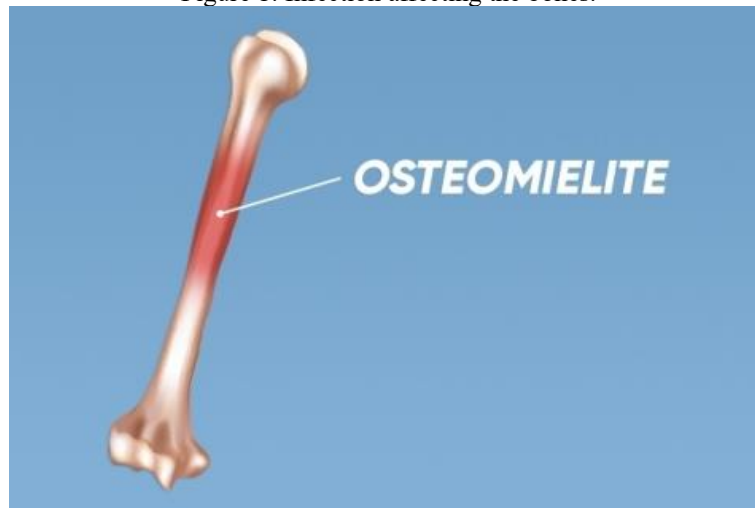
Figure 1: Infection affecting the bones.

The purpose of this article is to perform a brief theoretical review of the established knowledge about osteomyelitis and to describe the benefits and risks of the available treatments based on the real facts presented here (Figure 1).