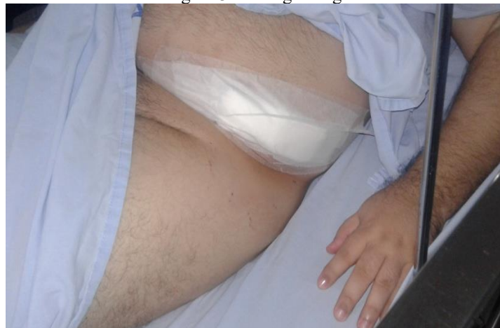
Figure 3: Bone grafting.

First bone graft performed in April 2012 due to bone non-consolidation in the right femur. (Figure 3).