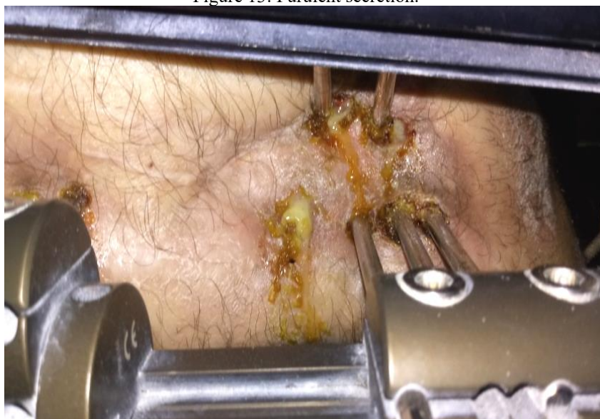
Figure 13: Purulent secretion.

In September 2019 the patient with purulent secretion being performed surgery for joint manipulation procedures under general anesthesia wires intraosseous pins and screws tenolysis tenodesis surgical femur and tibia. There were several painful surgical and home recovery procedures (Figure 13).