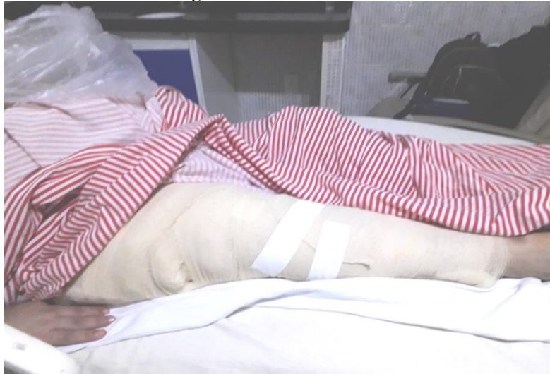
Figure 14: Fixator removal.

The patient in October 2020 underwent the procedure of external fixator removal due to infected pseudoarthrosis and cleaning of osteomyelitis for a time interval as a rest for the patient to thus perform ACL surgery surgery done through small cuts and with the aid of arthroscopy, in order to facilitate postoperative and recovery because of injury to his ligaments due to screws placed in the initial treatment. (Figure 14).