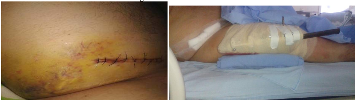
Figures 6 and 7: Bone Graft.

Patient in February 2017 was performed the procedure of placing external fixator in the tibia/osteomyelitis due to the degree of shortening 12 cm of bone loss and thus start the stretching process this time in the tibia, because the femur was already very suffering.(Figures 8 and 9).