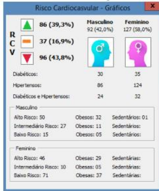
Figure 01: results of cardiovascular risk classification according to the spreadsheet implemented.