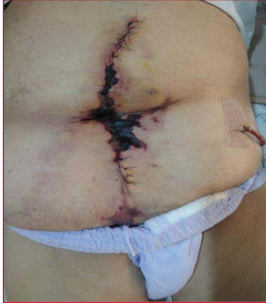
Figure 2 – Signs of necrosis in an abdominal surgical wound