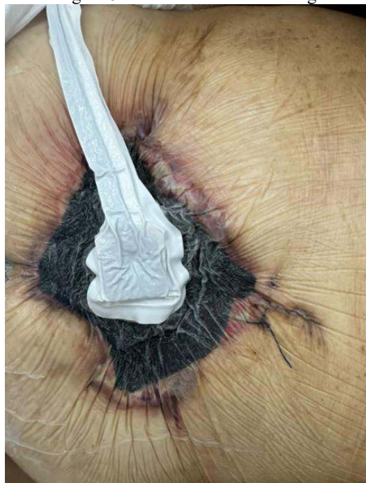
Figure 5 – Use of vacuum dressing.

After 2 days of the second surgery, the patient developed a new necrosis of the wall at the edge of the wound, and a new debridement was performed. The established hypothesis is that wall necrosis evolves after tissue ischemia resulting from significant oxidative stress aggravated by the patient's comorbidities. With tissue debridement, the final approach was to opt for closure by second intention, using a vacuum dressing to assist in the process (Figure 5).