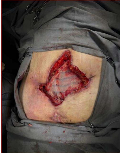
Figure 4 – post-debridement surgical wound