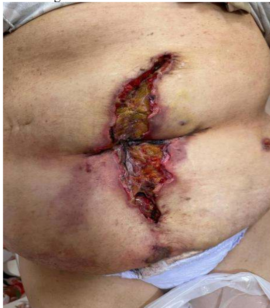
Figure 3 – Post-debridement wound

After 20 days of surgery, the patient developed signs of necrosis of the surgical wound in the central median region, which remained dry with phlogistic signs and no exit of purulent secretion ( Figure 3 ). The patient reported that he had no systemic symptoms, such as fever, nausea or vomiting, as well as no pain. Tissue ischemia was then confirmed, and he was referred to a plastic surgeon for evaluation, followed by debridement of the dead tissue. After 7 days, the patient presented a new necrosis with a foul odor, but without systemic signs, and she was hospitalized and underwent extensive debridement in the operating room ( Figures 3 and 4 ).