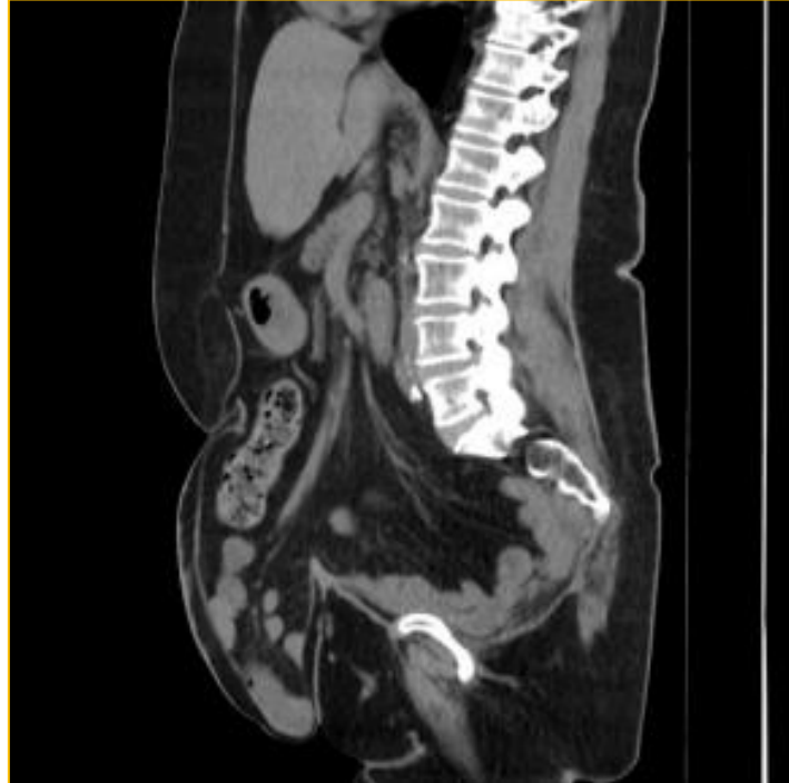
Figure 1 – CT scan sections of the abdomen