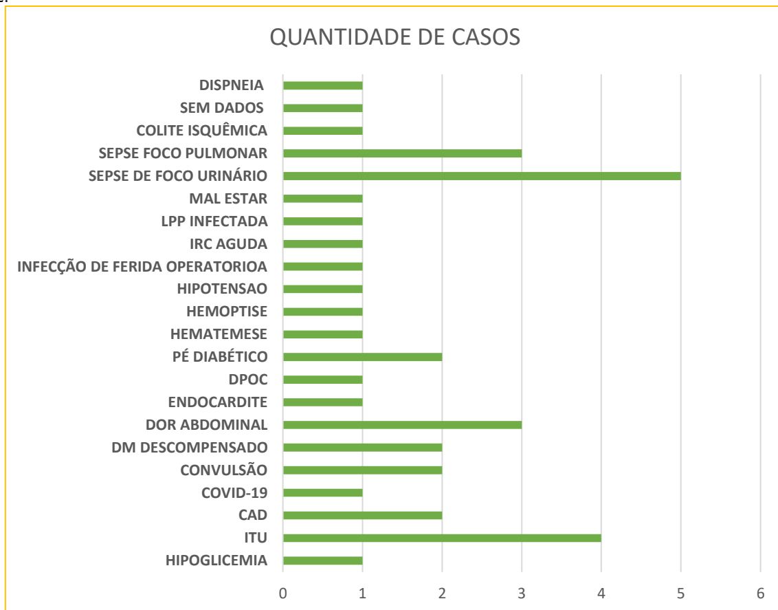
Figure 2. Hospitalization diagnosis by the number of cases of elderly diabetic patients between the years 2015 and 2022.

Legend: PPL (infected pressure injury), CRF (chronic renal failure), COPD (chronic obstructive pulmonary disease), DM ( diabetes mellitus ), DKA (diabetic ketoacidosis), UTI (urinary tract infection).