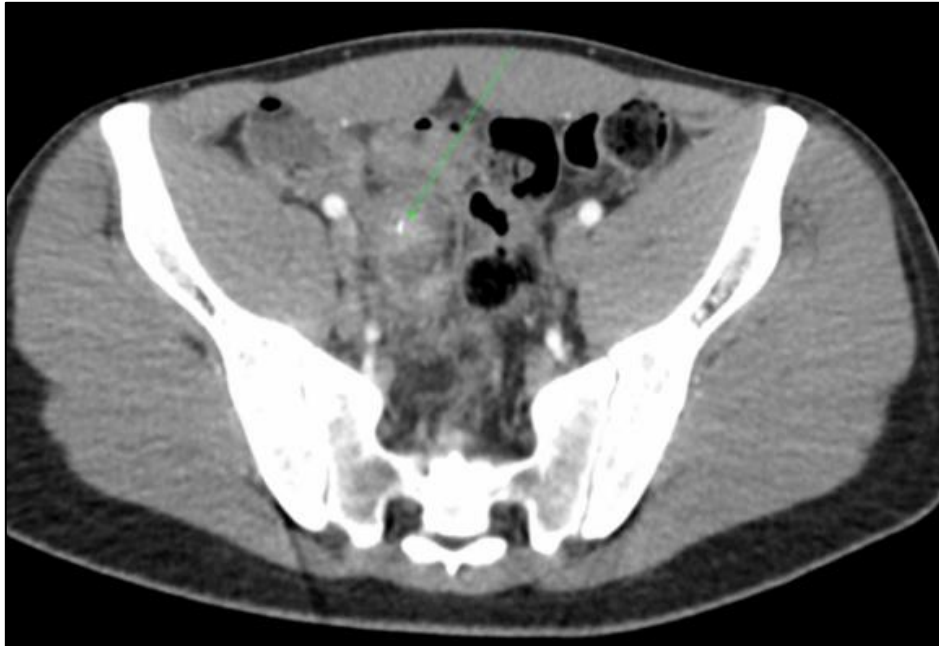
Figure 3: In addition, there is peritoneal thickening (peritonitis), which also speaks in favor of a possible perforation. But it does not have well-defined organized collections for examination.