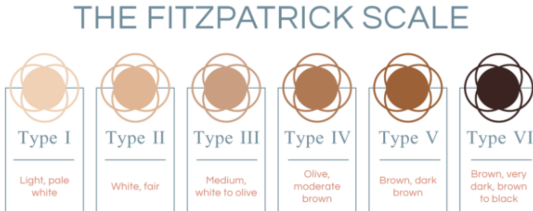
Figure 2. Fitzpatrick's skin type system.