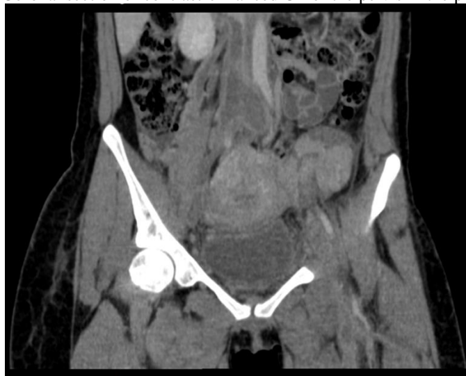
Figure 1: Coronal section of contrast-enhanced CT of the pelvis in the portal phase.

was identified. The patient evolved with pain in the left inguinal region during the investigation period and, after performing a new Doppler US, another DVT in the left inferior limb was confirmed. Continued the diagnostic investigation with abdominal computed tomography (CT) without contrast, a small perivesical collection was visualized, possibly corresponding to residual post-surgical edema. The CT showed venous thrombosis in the infrarenal portion of the inferior vena cava, in the external and internal common iliac veins, in the bilateral common femoral veins, and in the infrarenal portion of the inferior vena cava. Antibiotic therapy (ATBT) was started with intravenous (IV) meropenem 1g 8/8h and gentamicin, and a new contrast-enhanced CT was ordered, which showed edema in the fat planes of the pelvic region associated with DVT in: the infrarenal portion of the inferior vena cava; external and internal common iliac veins; bilateral common femoral veins; and the right ovarian vein. After five days' maintenance of the combined use of ATBT and ACO, there was complete regression of symptoms.