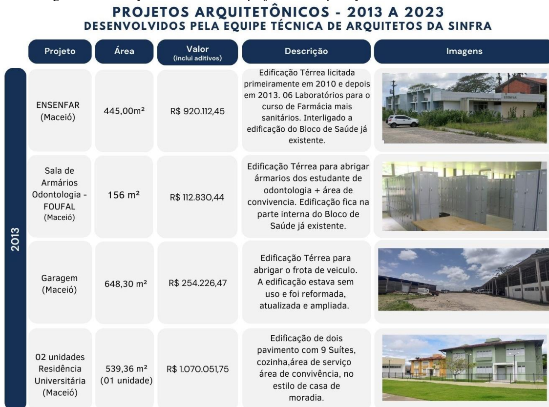
Figure 4: Summary table of the bidded projects developed by the technical team - Ufal

To carry out the analysis, the projects were gathered in chronological order of the bidding, in order to facilitate the understanding of how the aforementioned events directly interfered in this production. Figure [4]. In addition, it is worth noting that the projects analyzed are only those that have been or are being executed, as there are architectural projects in the sector's archives that, although completed, were not executed due to lack of financial resources.