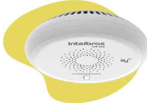
Figure 8: IDF 620