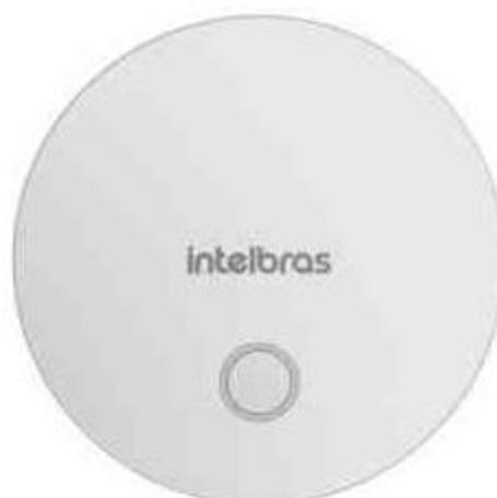
Figure 15: ICA 1001

For the connection of the automation devices it is necessary to install a central HUB where the devices will be connected. For this, the HUB already required by the chosen devices was dimensioned, which is the ICA 1001 from Intelbras, where it is possible to connect up to 32 devices per HUB within a radius of 100 meters, and thus allocating all to a single platform. This HUB is compatible with voice assistant and has ZigBee technology, this device will be in the CPD room where it will connect with the devices.