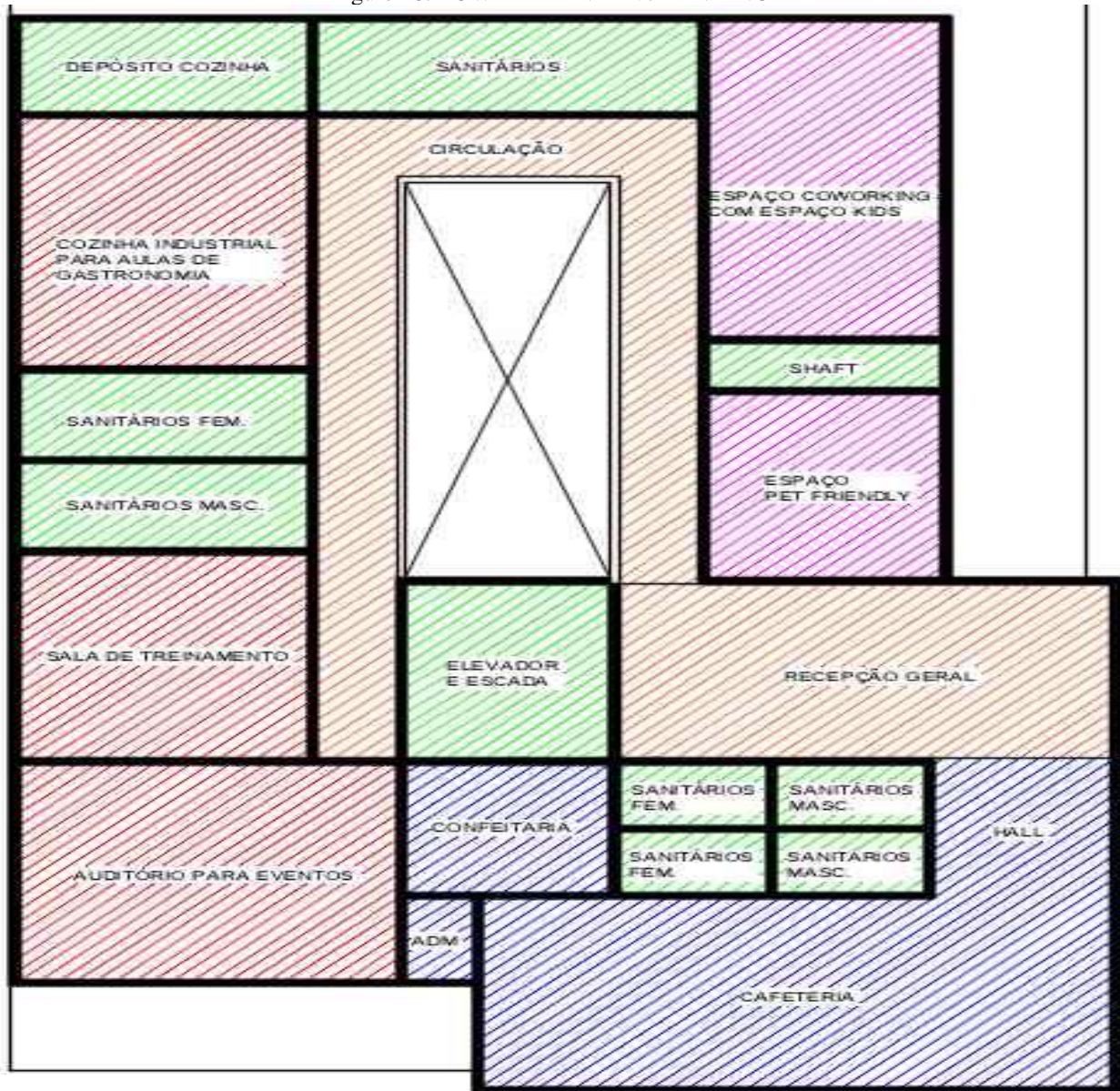
Figure 18: LOWER PLAN PAV. LANDING