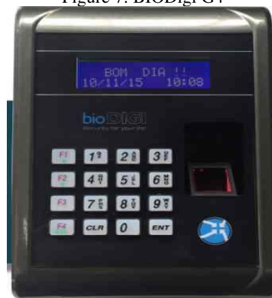
Figure 7: BIODigi G4

The access control to the floors of the building will be performed by the BIODigi G4 device, where only previously authorized people will have access to each respective floor. With registration capacity for 5000 users, this device has TCP/IP connection and record of up to 200,000 events. It also has access by biometrics, RFID card and password.