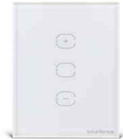
Figure 2: EWS 1101 switch

The smart dimmer switch EWS 1101 allows you to control the light intensity of the room via touch keys, smartphone or voice assistant. The touch dimmer switch, designed for use with dimmable lamps and easy to install in 4×2 boxes, allows you to adjust the intensity of the lighting to create a more pleasant environment and avoid excess light, saving electricity. The Izy Smart app allows you to create schedules to turn on the light automatically, as well as trigger actions from sensors and other devices in the Izy range.