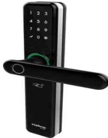
Figure 6: Intelbras IFR 7000 lock