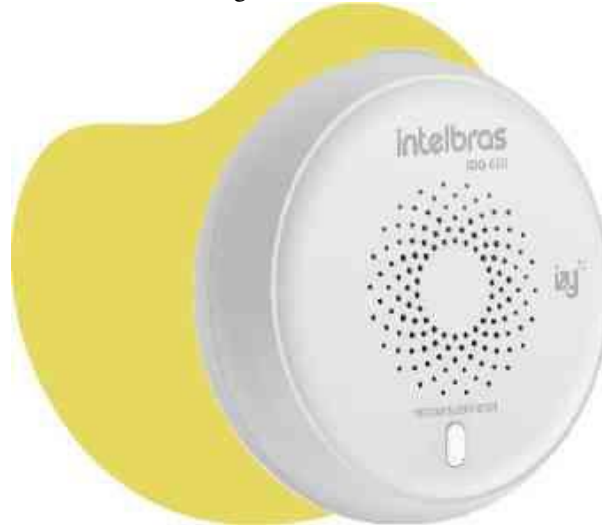
Figure 9: IDG 620

With the same operating principle as the IDF 620 mentioned above, the gas detector (IDG 620), acts when it detects the presence of LPG gas in the environment.