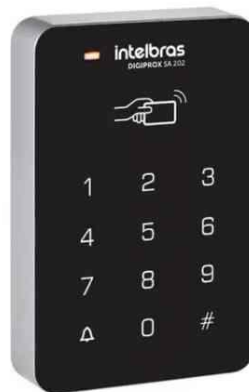
Figure 5: Access control SA202

For the access control of the meeting rooms (01 to 05), access controllers of the SA202 model will be installed from 390intelbras, this type of controller has the control of up to 1000 users where they only entered the enclosure if they obtain in hand the RFID card already previously registered at the gatehouse. For the cleaning of the enclosures the SA202 also has opening from password, which the respective employees will have access.