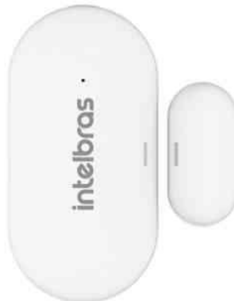
Figure 11: ISA 1001

The opening sensor present in the building will be the Smart ISA 1001 this Intelbras sensor has a connectivity with the hub of up to 100m outdoors, and it will be in charge of sending a notification to the device if there is any door, window or drawer opening where it was installed, and thus having greater security and control of the establishment.