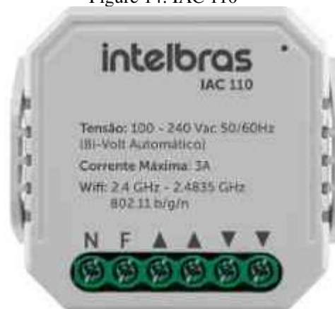
Figure 14: IAC 110

With the smart curtain actuator of the Izy line from Intelbras it is possible to activate the opening and closing of the curtains from wherever you are, program the opening and closing of the curtain for the time you want, adjust the opening and closing time. With the IAC 110 it is also possible to activate the device through a voice command.