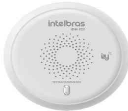
Figure 10: IDM 620