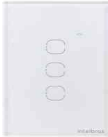
Figure 3: EWS 1003 switch

possible with this device, as well as, the interconnection with other devices of the Izy line thus making the environment automated.