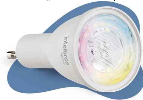
Figure 1: EWS 440 lamp