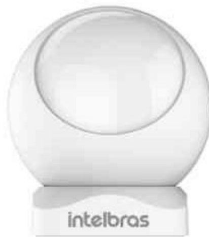
Figure 12: ISM 1001

In order to detect people traveling through corridors and enclosures, and also to save electricity, the building will have presence sensors previously installed in strategic locations. The ISM 1001 motion sensor is completely wireless and features ZigBee technology, ensuring a longer battery life and operating speed. With it, it is also possible to create automation scenarios, such as opening the curtain of the room, when detecting presence in the place.