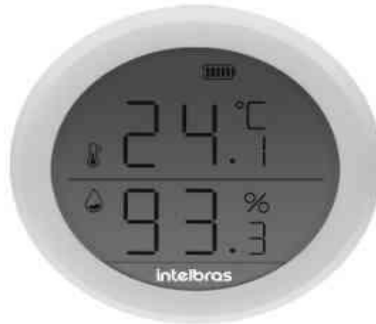
Figure 13: IST 1001