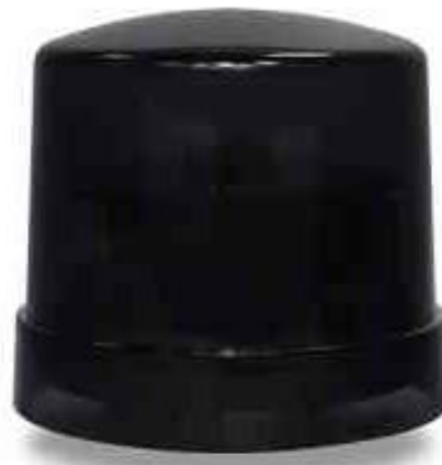
Figure 4: LoRa IoT photocell

The lighting in the parking lot will be controlled by a Khomp IoT LoRa photocell. These devices, which are mounted above the luminaires, use programmatic dimming, i.e. automatically decreasing or increasing the light intensity according to the time of day, to reduce energy consumption. The Khomp IoT photocell models continue to surprise, performing various measurements via LoRa communication, including voltage, current and electrical power factor. In addition, there are models that provide incident reports such as power outages and load overcurrents. Others have a high level of intelligence and include integrated GPS (which makes it easier to locate a vehicle for maintenance) or an accelerometer/gyroscope (which monitors the angle of the sun in case of an accident).