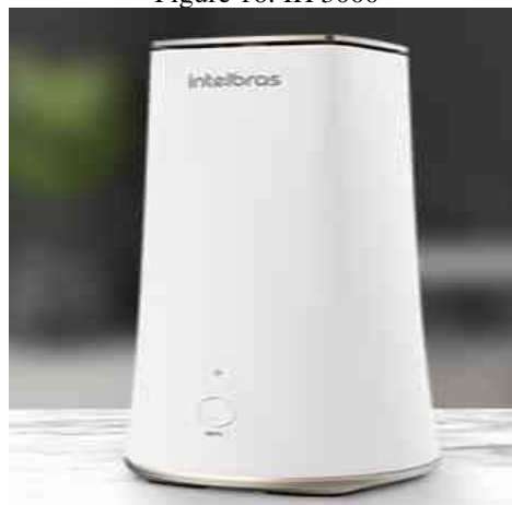
Figure 16: IH 3000

For this, Intelbras Wifi 6 Mesh, IH 3000, was dimensioned. The 802.11ax Wi-Fi standard is the latest technology in wireless connection, capable of traveling much more content and more speed. With dual band capability it is possible to generate up to 3 Gbps* of traffic (INTELBRAS, 2023). With embedded technology, the Wi-Fi 6 signal will have a connection with more performance and a more intelligent signal direction. Each IH 3000 router expands up to 300 m 2 and up to 128 connected devices on each.