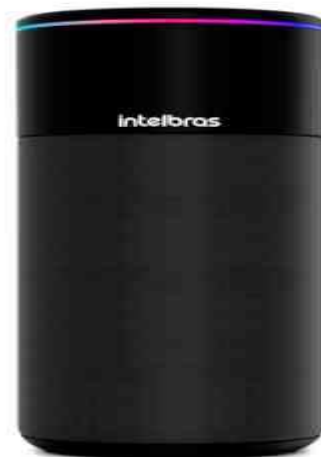
Figure 15: ISS 102 A