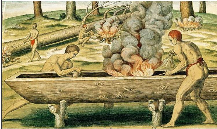
Figure 2 - Illustration of the making of an ubá