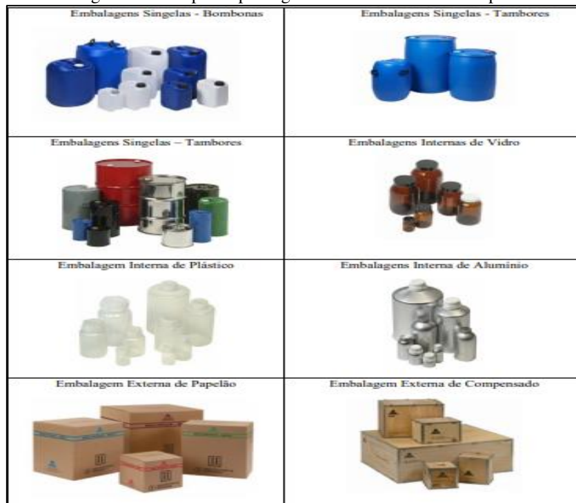
Figure 3- Example of packages used for breakbulk transport

The image below shows numerous examples of packaging used for the function of fractional transport of dangerous goods to be completed in the best and safest way possible.