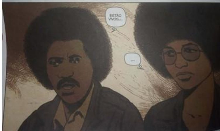
Cast Iron: Cross (2020)

In these two comics, there are two characters: the member of the Black Panther group and Angela Davis. The text in both comics matches the image of relief. The faces of the characters do not represent fear, nor aggressiveness, nor joy, nor revolt, but relief.