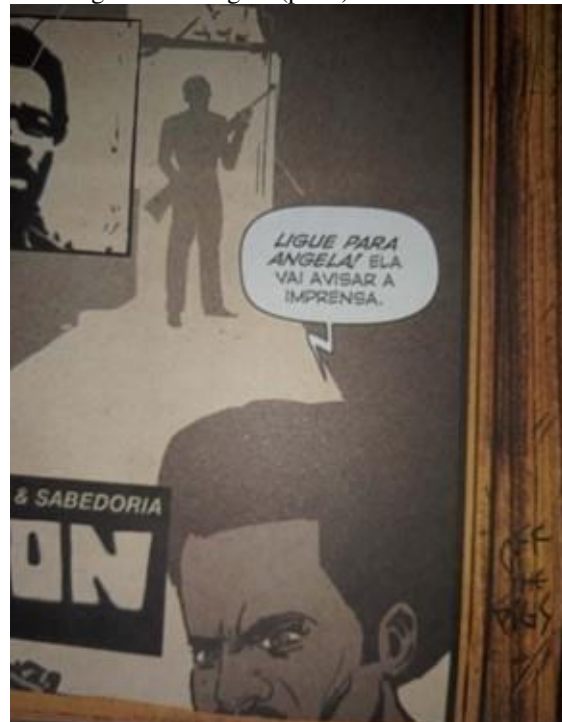
Cast Iron: Cross (2020)

The communicative act in the comic indicates that the speaker acts, imposing an order on someone and establishing communication. This communication, as an enunciative act, is elocutive, as it allows the speaker to impose an order without the need for intervention by others. The " CALL ANGELA " generates an action of the speaker on the interlocutor, even if the interlocutor (not present in the comic) does not participate directly in that order.