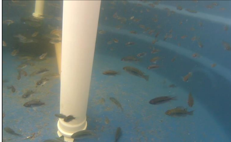
Figure 2– Tilapia fingerlings