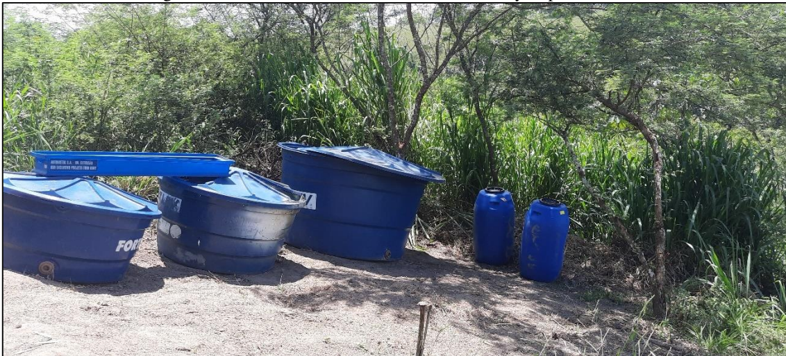
Figure 10– donations and materials for community implementation