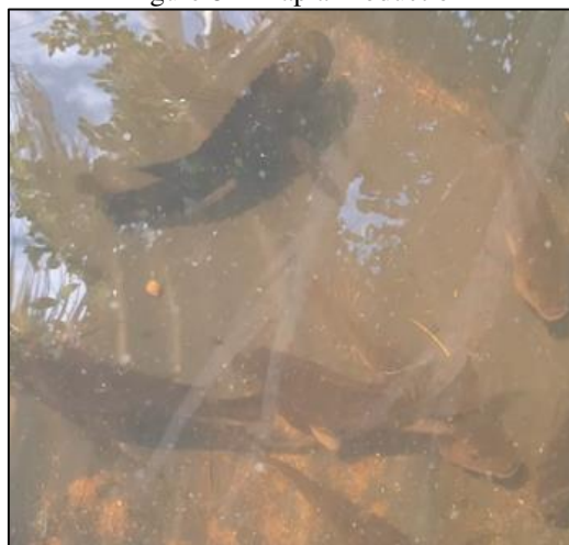
Figure 8– Tilapia Production