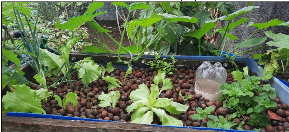
Figure 5– lettuce chives, mint, pumpkin