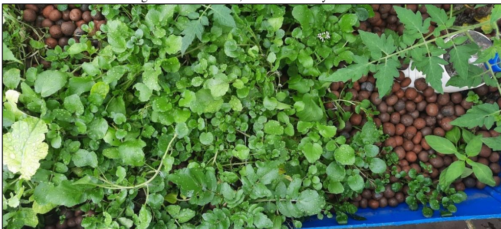
Figure 6– watercress, mint and cherry tomatoes