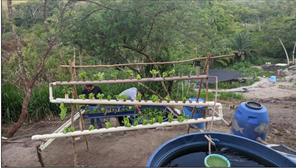
Figure 11– Implementation of the extension and innovation project – Residential aquaponics