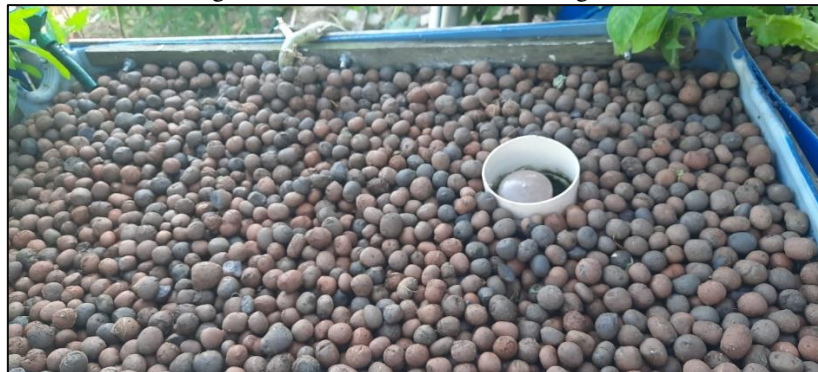
Figure 3– Cultivation bed for starting tests