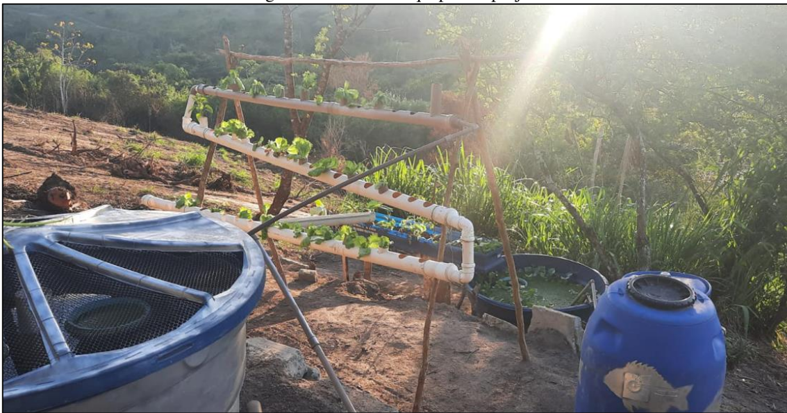
Figure 12 residential aquaponics project