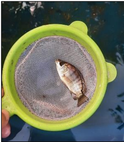
Figure 7– Fish from the fry stage to the young stage

When the term waste is discussed in this study, we can also talk about the use of water to maintain vegetables in a conventional way, which generates a cost in production. In aquaponics, this water expenditure is reduced by 85% to 90%. It is only necessary to change the water when chemical parameters are high. Figure 8 shows the water quality in a recirculation model known as RAS, without the need for water exchange and waste.