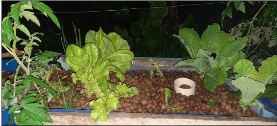
Figure 4– lettuce, cabbage, chives and cherry tomatoes