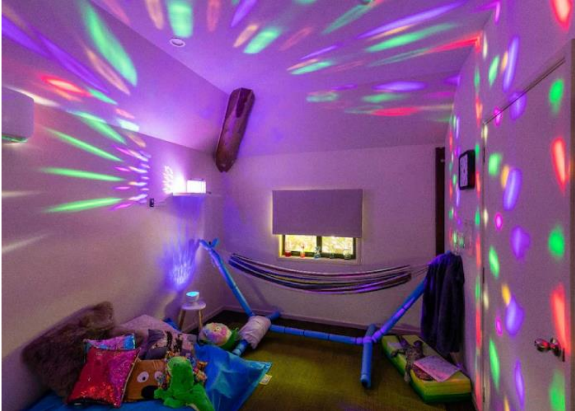
Figure 1: Calming and engaging sensory room.

that offers a firm base while providing comfort and calming sensory stimuli can make a significant difference in the daily lives of these individuals.