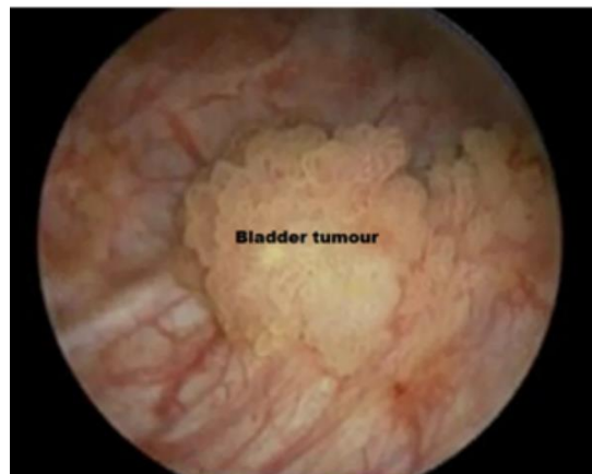
Figure 1. Bladder tumor.

Transurethral resection of bladder tumors (TURP), FIGURE 1, is the endoscopic removal of tumors within the bladder. Most bladder tumors are cancerous and must be completely resected to prevent recurrence and determine their stage. This is determined by separate biopsies from the base of the tumor, while the risk of recurrence is determined by biopsies of the bladder. Accurate sampling is important because subsequent treatment depends on staging. Because bleeding may be excessive, any blood-thinning medications, such as aspirin or Plavix, should be discontinued 1 week in advance (Jones et al., 2020).