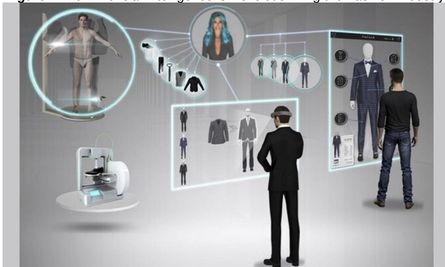
Figure 1: How Artificial Intelligence is Revolutionizing the Fashion Industry.

Beyond aesthetic design, AI is also revolutionizing garment modeling and production. Software like CLO 3D and Browzwear enables the creation of high-fidelity virtual clothing, reducing the need for physical prototypes and minimizing fabric waste. Smart algorithms can optimize material cutting and adapt patterns to different body types, promoting greater inclusion and personalization. Companies like Nike and Adidas have already implemented smart robots in their factories, accelerating production without compromising the quality of the pieces.