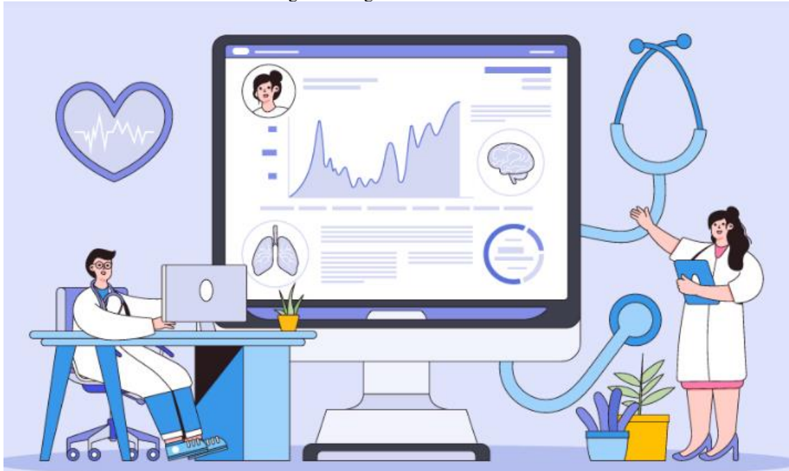
Figure 1: Digital medical records.

The existing paper-based health records documentation risks compromising healthcare services due to potential data errors and delays, prompting many healthcare systems to adopt digital medical records. Utilizing advanced digital technologies can offer healthcare workers (HCWs) real-time, accurate information access and decision support for improved clinical care. Additionally, digital registration applications enhance monitoring and interaction among healthcare professionals across various healthcare settings (WHO-SEARO, 2024).