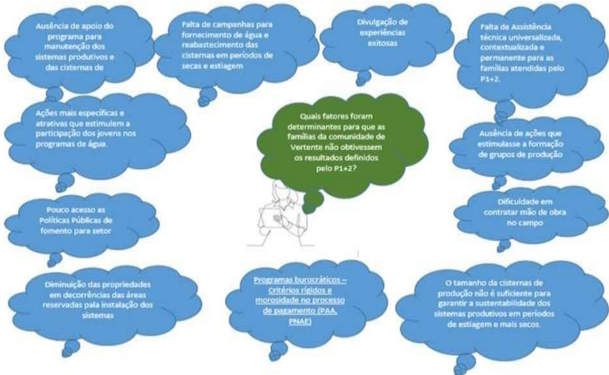
Figure 1 – Systematization of the problems pointed out by farmers in the conversation circles held in the community of Vertente, 2024.

community will outline the strategies and solutions for each problem.