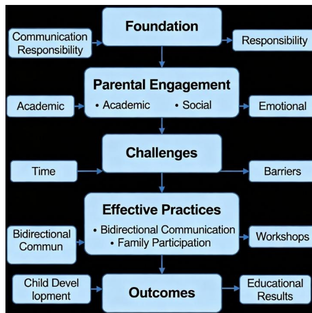
School-Family Partnership Process for Meaningful Learning