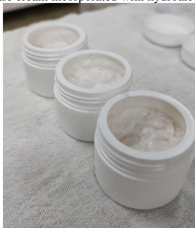
Figure 2. Base cream incorporated with hydroalcoholic extract

According to Table 3, the sensory characteristics of the product remained unchanged in color, odor, and appearance during the tests performed over an evaluation period of 0 to 15 days (figure 2). During this period, the moisturizer retained a slightly pinkish color, a homogeneous and dense texture, and a characteristic aroma, and remained stable in macroscopic terms. All the samples presented creaming (figure 3) in the centrifugation test, which may be due to a disproportion in the number of inputs of the oily and aqueous phases, excessive or insufficient agitation, temperature shock during agitation, or excessive heating of the phases, and also inadequate pH.