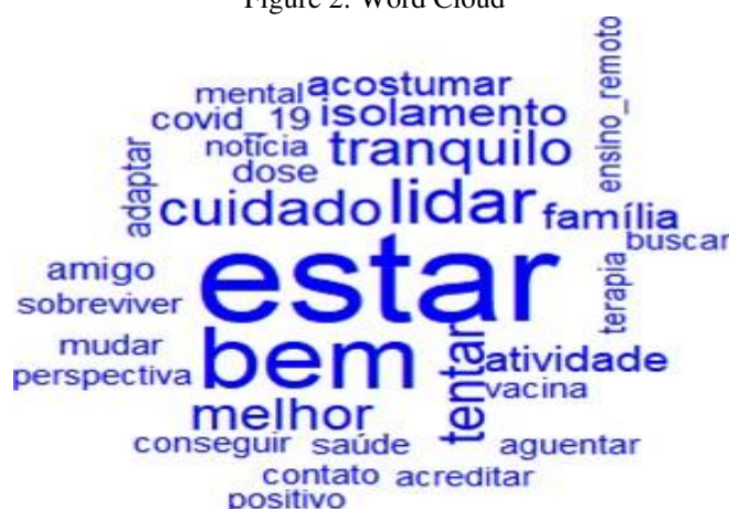
Figure 2: Word Cloud