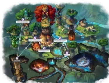
Figure 1: Location of missions on the map.