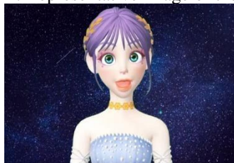
Figure 2: Representative image of the video.