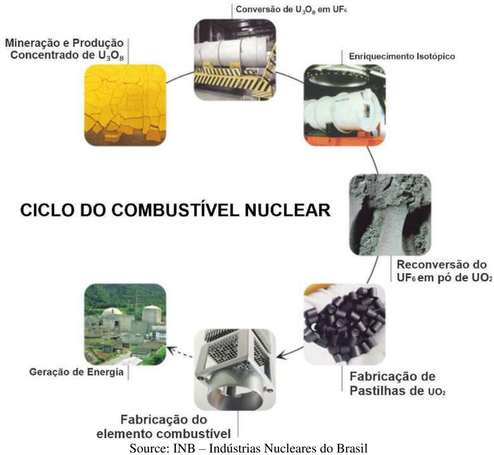
Figure 1 - Stages of the Nuclear Fuel Cycle