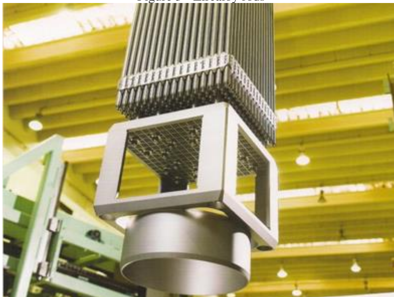
Figure 3 - Zircaloy rods

Ready-made uranium pellets are stacked on Zircaloy rods, a super-resistant alloy.