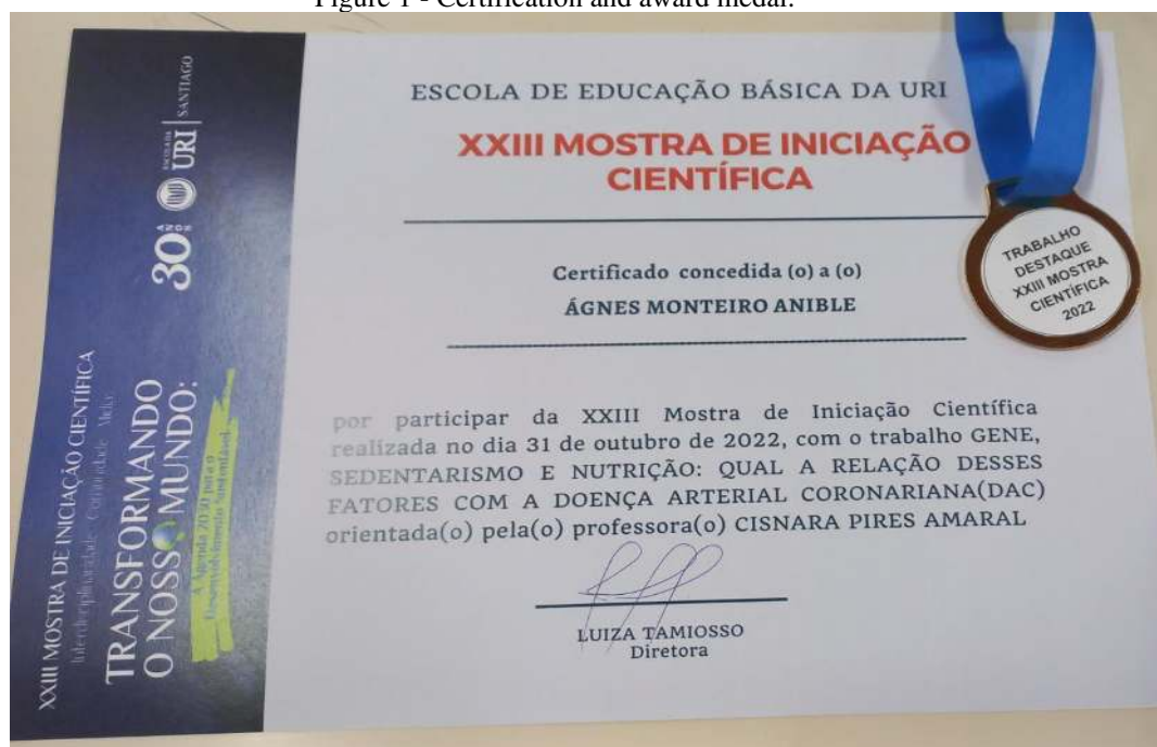
Figure 1 - Certification and award medal.

using knowledge in their daily lives, making analogies, reflective thinking, autonomy to make decisions and criticality regarding lifestyle habits. Besides the recognition that genetics or environmental factors are related, that everything in our body is related, including our perceptions and thoughts. That we experience times of choices, which can positively or negatively affect our health and that of our family members.