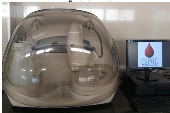
Figure 15 – A15

In the laboratory is provided the most diverse tests. Below are some images of the main equipment used: