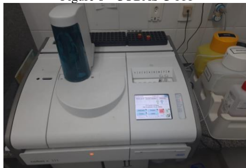
Figure 8 - COBAS C 111