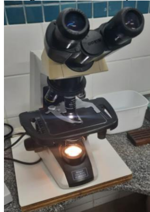
Figure 7 – Microscope