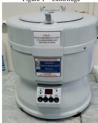
Figure 1 – Centrifuge