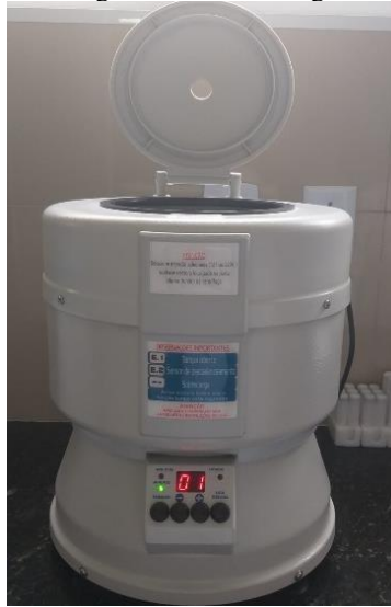
Figure 20 – Centrifuge