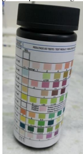
Figure 3 - pH Measuring Tape