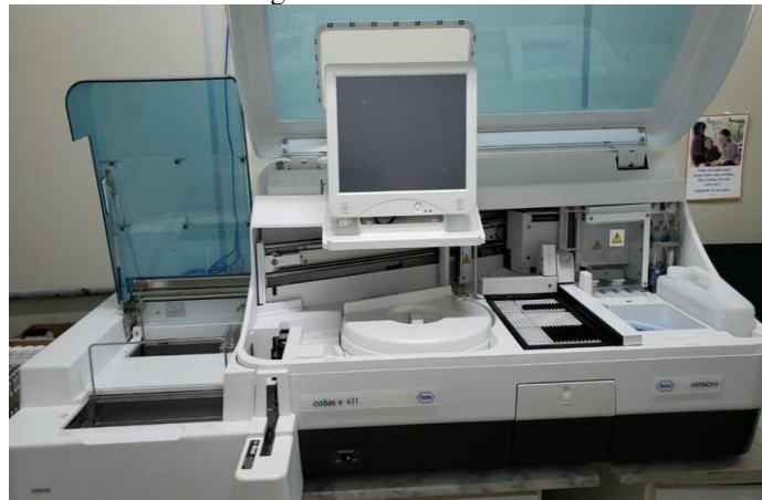
Figure 6 - cobas and 411