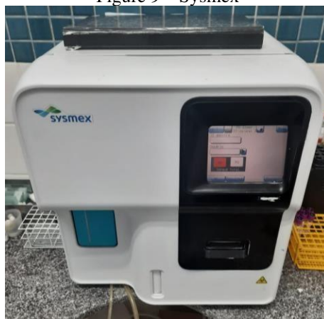
Figure 9 – Sysmex