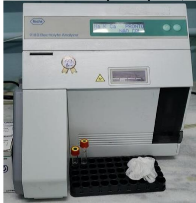
Figure 2 - 9180 electrolyte analysis - (Roche)