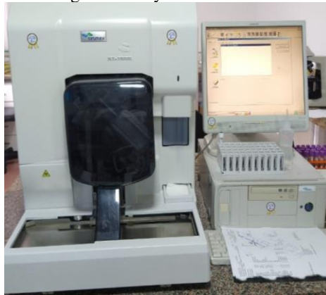
Figure 12 - Sysmex XT-1800i