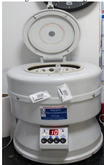
Figure 11 – Centrifuge

Routinely, every day I did blood smears, colored the slides, and visualized in the microscope where I did the count and observed the cells, and also made urine every day visualized them in the microscope observing them and reporting with the help of the preceptor always checking if everything was correct.