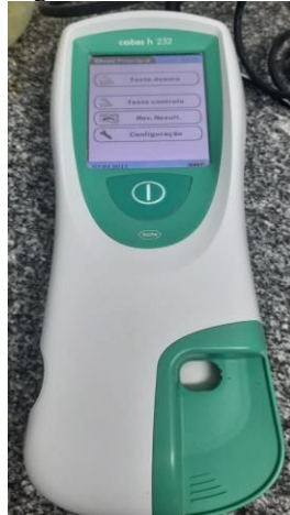
Figure 10 - Cobas h 232