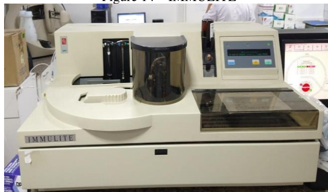
Figure 14 – IMMULITE