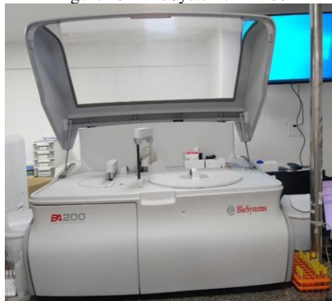
Figure 13 - BioSystems BA200