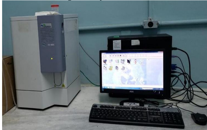
Figure 5 - Sysmex XS-800i