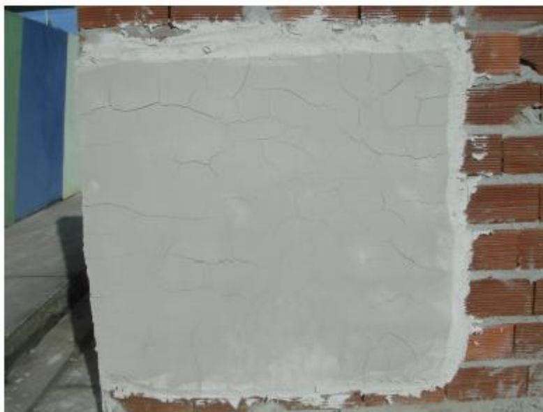
Figure 11: Formation of cracks mapped in direct application on masonry

In the coating applied over direct masonry, however, mapped cracks were formed, indicating a direct relationship with the absorption of the base (figure 11). In addition to this aspect, the finish with excessive flatness and the excess of fines, caused by the addition of cement, in addition to the thickness used, outside the manufacturer's recommendations, can explain the pathologies verified in the coating.