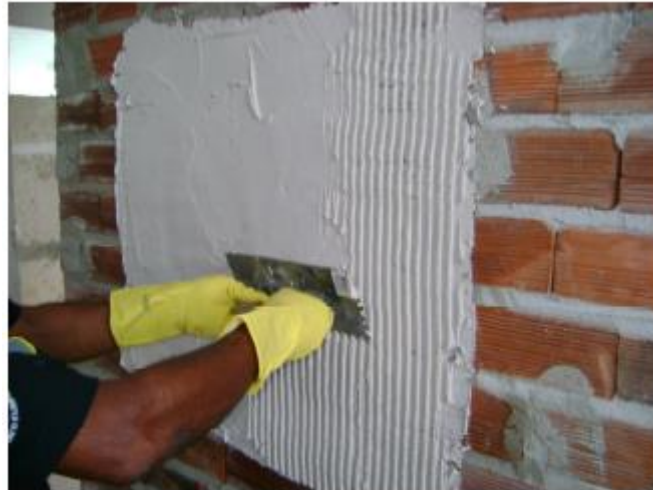
Figure 13: Execution of base preparation

After 24 hours of application of the base layer, with a thickness of 5 mm, the application of the plaster body or intermediate layer was started, which had a thickness determined at 10 mm, in order to avoid cracks caused by large thicknesses of the applied coating in a single layer. (Figure 13).