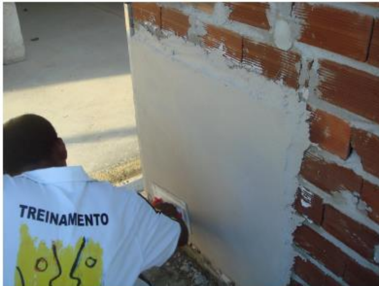
Figure 09: Finishing the surface with a PVC trowel

The surface finish was carried out by passing the trowel and in followed by a damp sponge (figure 08 and 09).