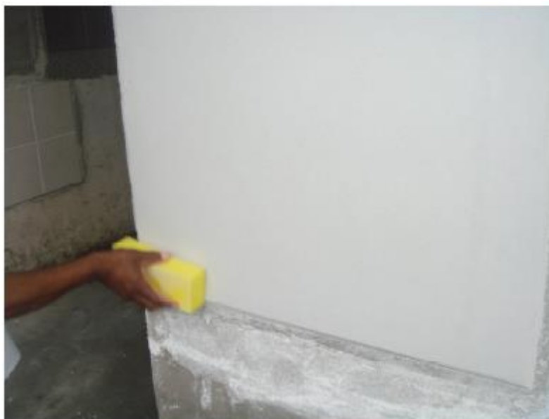
Figure 05: Surface finishing with trowel and sponge

The depressions were filled in and new screening was carried out, until a flat and homogeneous surface was obtained. The surface finish was obtained by passing the trowel and then a damp sponge (figure 05).