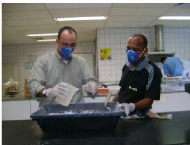
Figure 12: Preparing mortar A2

For the application of the product, a masonry wall of ceramic bricks was used, with 8 holes, (9x19x19 cm) settled with industrialized mortar, joints of 20 mm. Before applying the first layer (base preparation), the substrate was cleaned and previously moistened. The product was prepared in an airtight container, mixed by hand until obtaining a homogeneous mass without lumps. The mixture was carried out using a liquid additive mixed with the mixing water (1:4), whose objective is a better performance of the coating in relation to adherence to the substrate. (Figure 12).