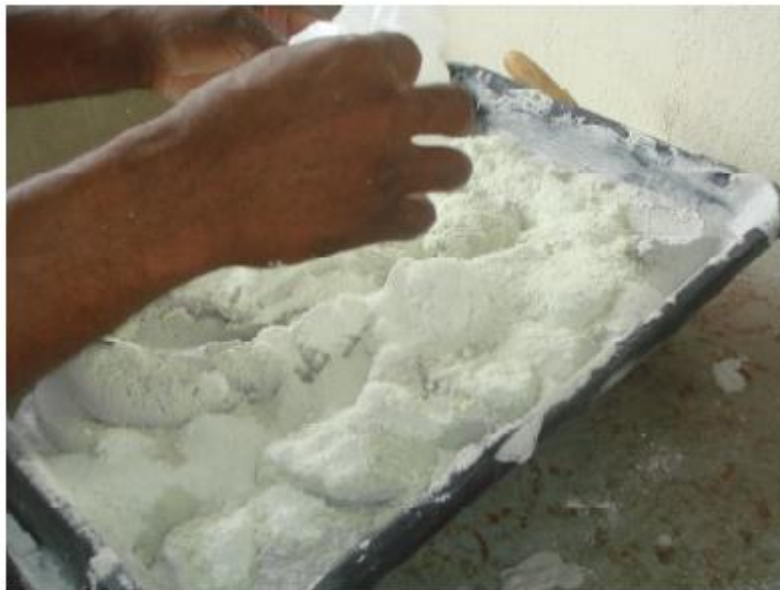
Figure 01: CPB-40 Cement Addition

The preparation of the product strictly followed the manufacturer's recommendations for applications in external areas. In an airtight, clean container, protected from the sun, wind and rain, the entire contents of a 20 kg bag were manually mixed (water was added little by little), until a firm, pasty consistency was obtained, without dry lumps. Cement was added to the product, (1 kg) for 20 kg bag of mortar.