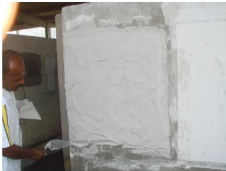
Figure 03: Application of lime mortar on cementitious substrate

Before application, the base was moistened to reduce the absorption of the support when in contact with the coating mortar, as shown in figure 02. The application was carried out using a PVC trowel and a trowel. (Figure 03)