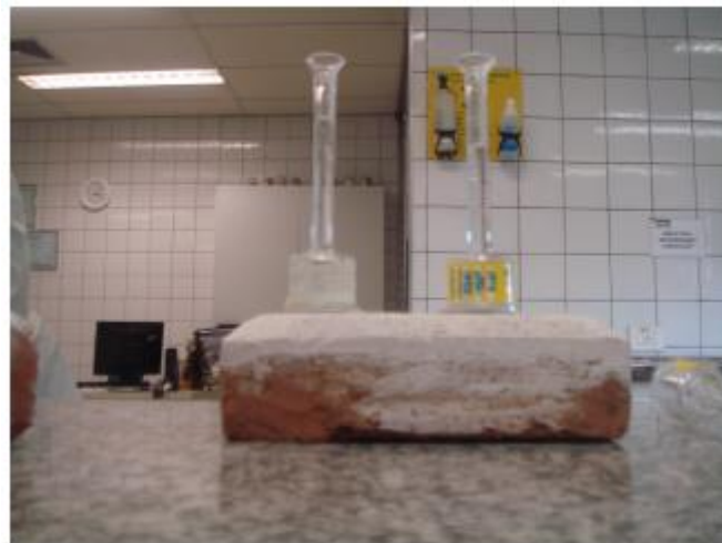
Figure 16: NBR 14992:2003 permeability test

The product did not withstand water pressure, showing an absorption equivalent to 4cm 3 for a 13 cm high water column for 8 minutes. Thus, we can say that the product offers good conditions for the coating to develop its characteristic water cycle, making it impossible to retain moisture in the masonry.