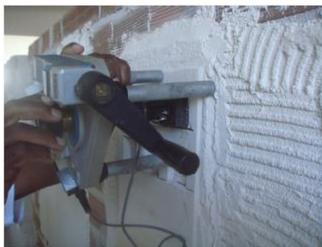
Figure 15: Tensile adhesion resistance test

The test was carried out 84 days after applying the first coating layer, in strict compliance with NBR 13528 (ABNT, 1995) which prescribes the method for determining the tensile adhesion strength of inorganic mortar wall and ceiling coatings. (Figure 15) ).