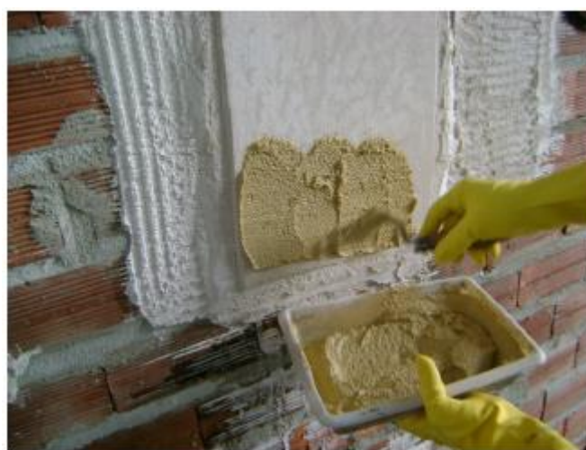
Figure 18: Lime and pigment-based mortar

Another alternative for obtaining the color on the facades can be in charge of the final plaster layer. This can be composed with inorganic pigments that allow, in addition to the chromatic effect, greater durability and compatibility with previous layers, with greater adhesion capacity than the currently used paint solutions. Mineral pigments are more resistant than organic ones and, due to their finishing thickness, they will make the color layer more durable, avoiding the degradation that can be seen in latex paints due to their low resistance to negative pressure caused by moisture trapped in the support.