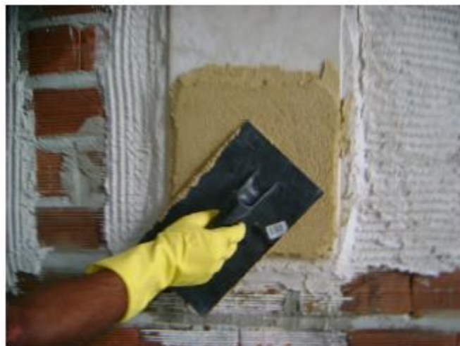
Figure 18: Finishing with a trowel

The facade painting solutions most used in the SHO are made up of PVA and/or acrylic latex paints. Such products have impermeable characteristics and, as previously noted, prevent the water cycle of old walls. Furthermore, such materials have a low resistance to moisture that migrates from the interior of the support, causing detachment, wrinkling, film breakdown, efflorescence, and discoloration, among other pathologies.