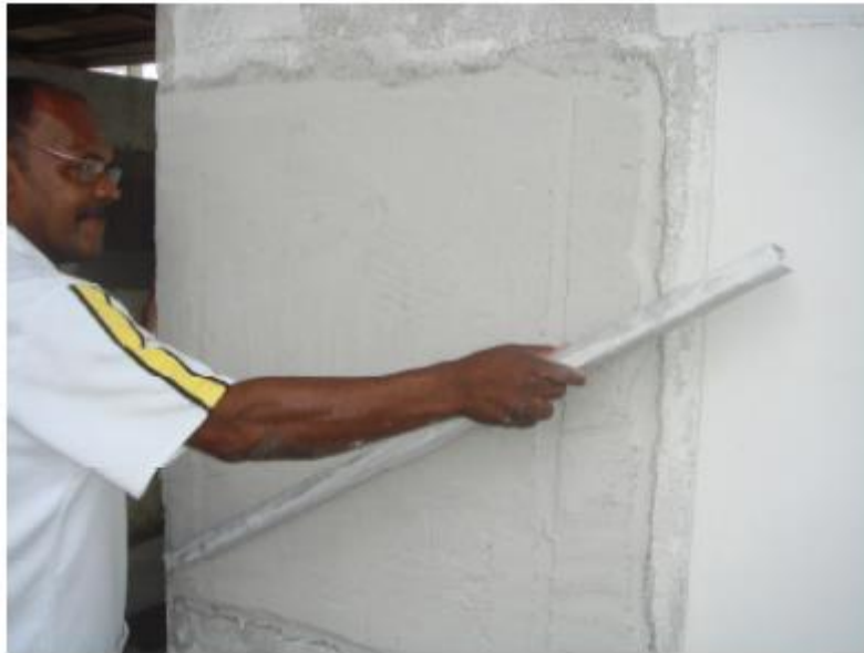
Figure 04: Removal of excess and leveling of the coating

removal of excess mortar and smoothing of the surface through screeding, using an aluminum ruler (figure 04).