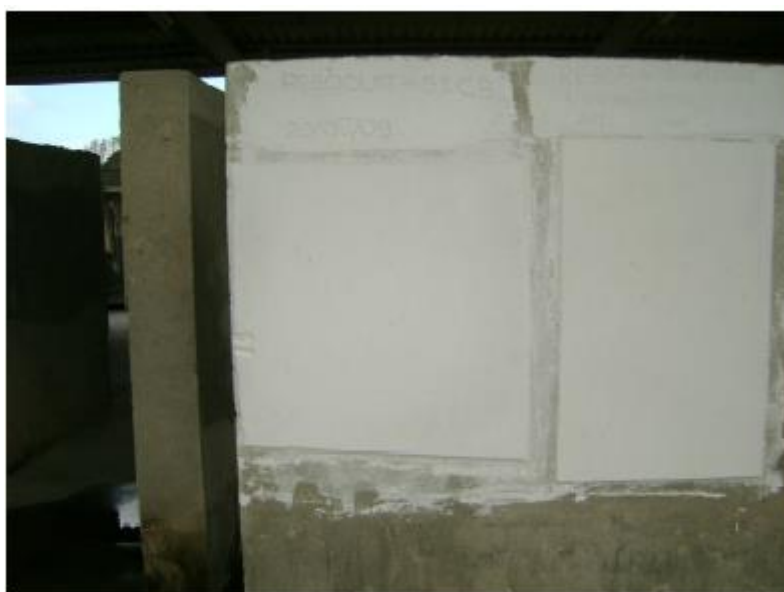
Figure 10: Coating executed with industrialized mortar with addition of CPB-40

According to the research carried out, the results do not express values that can justify significant changes concerning mortars consisting only of CH-I aerial lime as a binder.