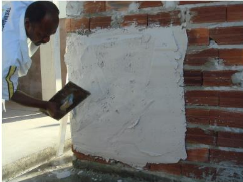
Figure 06: Direct coating application on the masonry

The entire coating operation was also carried out on a masonry surface, without base preparation, only cleaning and wetting the substrate as per (figure 06).