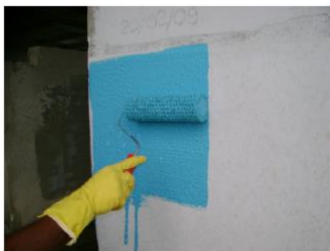
Figure 17: Execution of lime-based painting

For the preservation of the urban landscape of the city, however, it would be desirable to promote the physical survey of the surface of the facades, which could identify the superimposed colors and, if desired, define the colors of the first layers of paint. With this, linguistic errors, obliteration of decorative details and other mistakes could be avoided. Therefore, lime-based paints appear to be the most reasonable solution for use on SHO facades. Firstly, because of its compatibility with traditional renders. Secondly, due to its low acquisition and application cost, allowing for more frequent maintenance. Thirdly, it allows the wall to “breathe” while still having great resistance to the formation of fungi due to its high alkalinity.