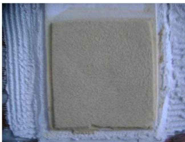
Figure 19: Final coating texture detail

The facade painting solutions most used in the SHO are made up of PVA and/or acrylic latex paints. Such products have impermeable characteristics and, as previously noted, prevent the water cycle of old walls. Furthermore, such materials have a low resistance to moisture that migrates from the interior of the support, causing detachment, wrinkling, film breakdown, efflorescence, and discoloration, among other pathologies.