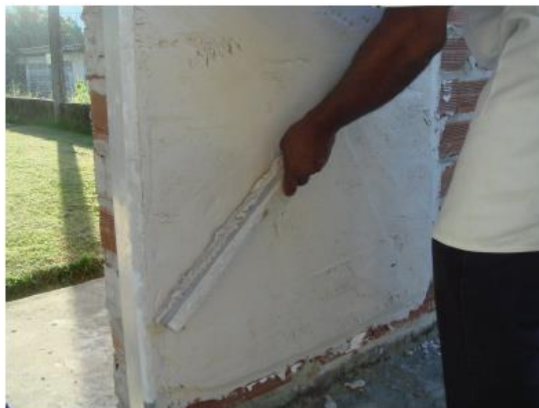
Figure 08: Mortar mortar applied directly on the masonry

In the application, there were no significant changes in the product due to the difference in the substrate. After a period of “pulling” the mortar, the surface was evened out using slatting, using an aluminum ruler (figure 07).