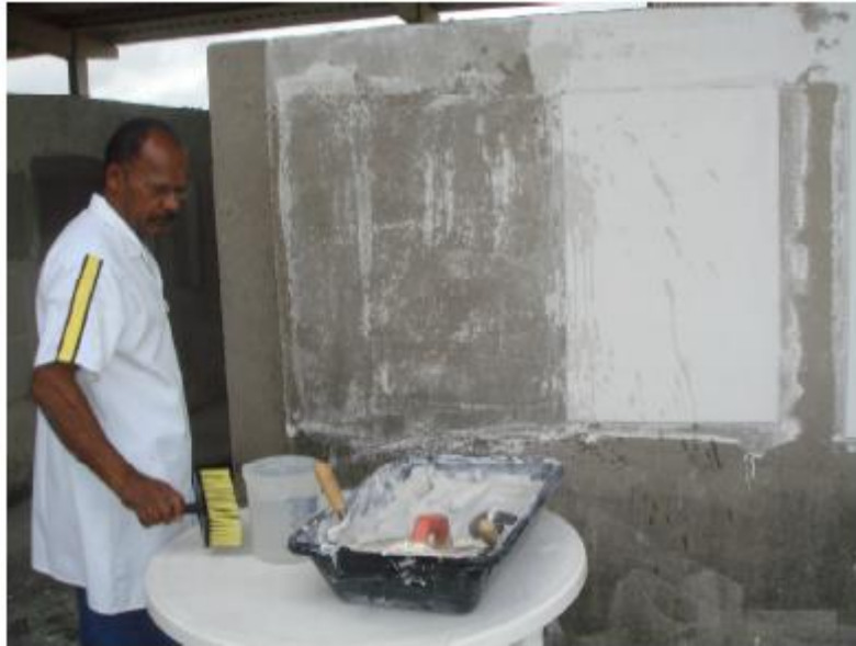
Figure 02: Base preparation for plaster application

Before application, the base was moistened to reduce the absorption of the support when in contact with the coating mortar, as shown in figure 02. The application was carried out using a PVC trowel and a trowel. (Figure 03)