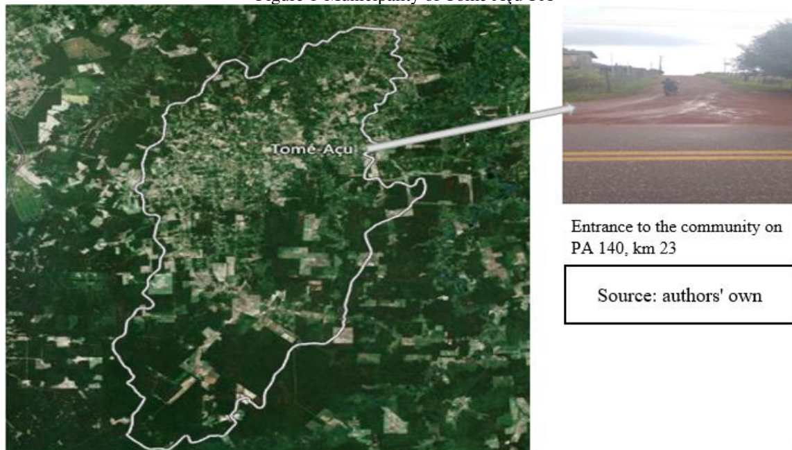
Figure 1-Municipality of Tomé Açu-PA