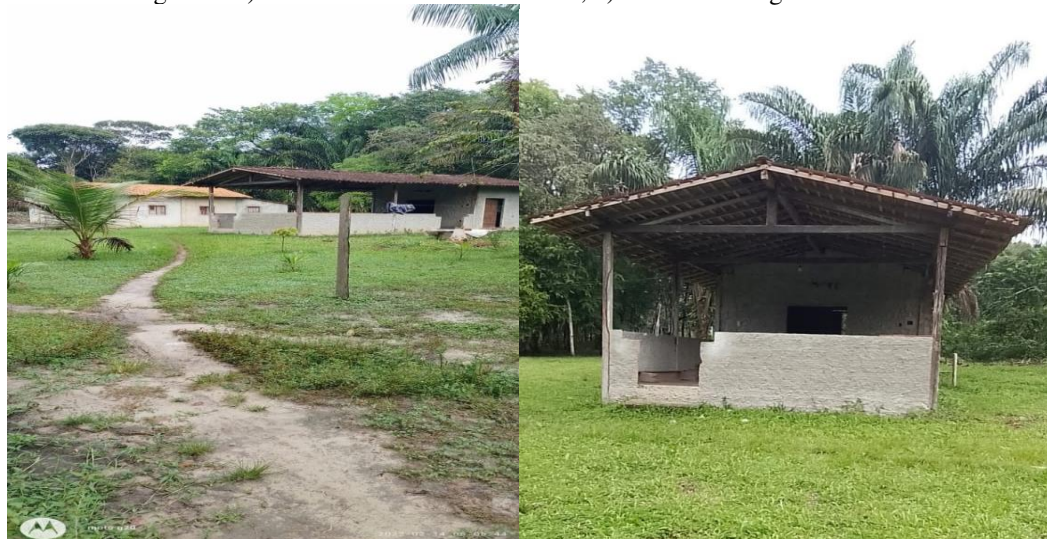
Figure 4: a) Panoramic view of the school; b) Access leading to the school.

social nature, providing for the full development of the person, his or her qualification for work, as well as the preparation for the full exercise of citizenship" (BRASIL, 1988). Thus, it is necessary to think of an education that guarantees the reduction of social inequalities (Figure 4 a and b)