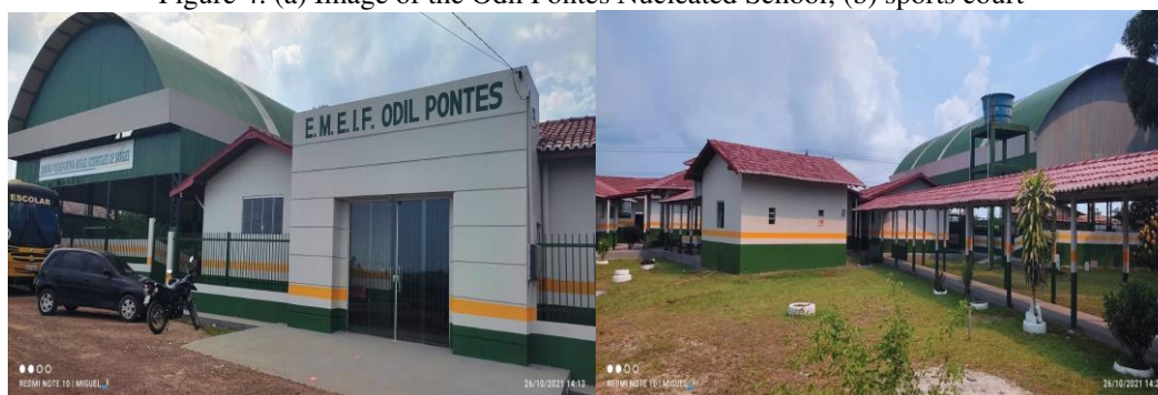
Figure 4: (a) Image of the Odil Pontes Nucleated School; (b) sports court

The Municipal School of Early Childhood and Elementary Education "Odil Pontes" (Figure 5 a and b) with INEP 15555437 which is located in Vila Nova Esperança highway PA 140 km 23 countryside spaces of the Municipality of Tomé-Açu. The school currently serves a total of 328 students divided into three shifts at the levels of early childhood education, pre-I and pre-II, elementary school, early years from 1st to 5th grade, final years, 6th, 7th, 8th and 9th grade, and the school operates officially authorized through Process No. 034/2012 by the Municipal Board of Education for operation of teaching modalities.