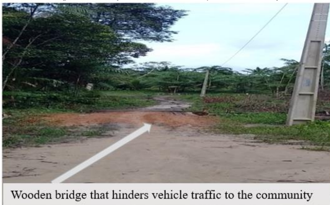
Figure 8: Difficulty of access for school transport to the community

As for the change in the family routine, all responded that there were changes where the distance causes a reorganization, because in some cases the parents needed to accompany their children to the new school, and the adaptation of these students to the new school, which could imply in their learning. The reason for parents to take their students to school is linked to the difficult access to transportation in the community. The picture (Figure 8) illustrates a stretch of the road that gives access to the community, because on the way there is a wooden bridge that in the winter period becomes dangerous for traffic.