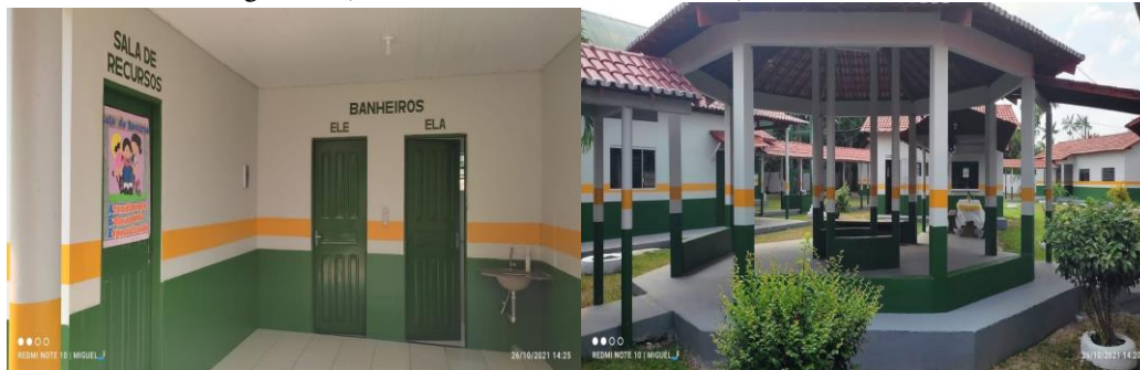
Figure 6- a) Bathrooms and Recuse room; b) Recreation area