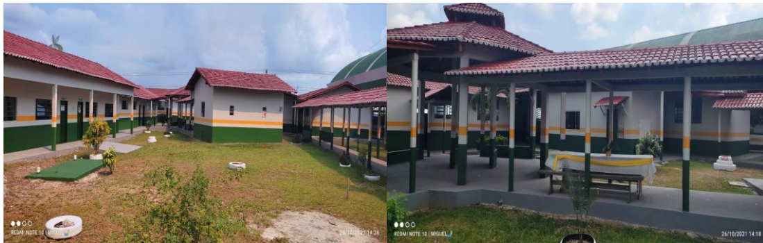
Figure 7 - a) The school has 11 classrooms and a multidisciplinary laboratory; b) Indoor covered spaces to access the classrooms.

The school is composed of 11 classrooms, a principal's office, 1 lunchroom, 1 canteen, a teachers' room, a computer lab, a library, a covered sports court, and a walled space with covered internal spaces for access to the classrooms (Figure 7 a and b).