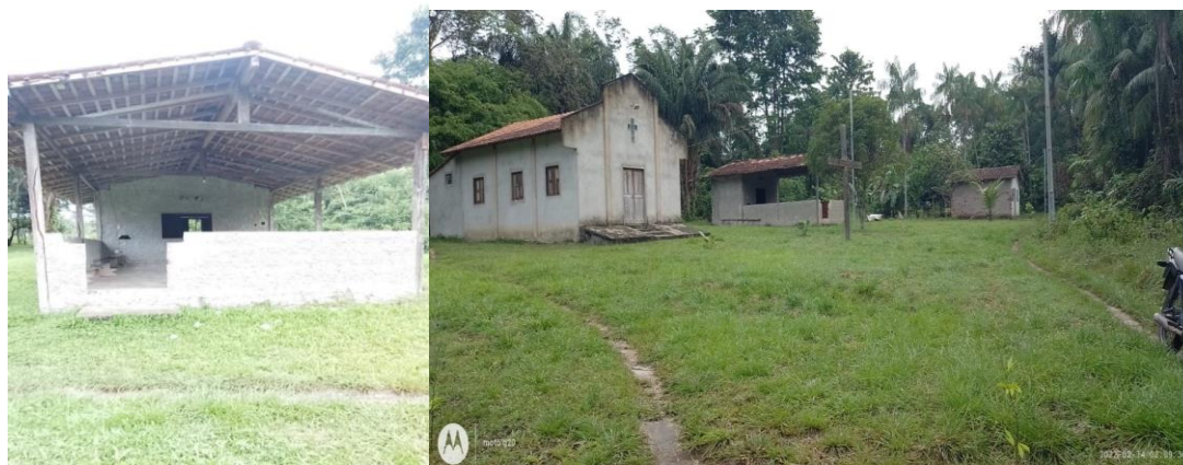
Figure 3- (a) House where the community school used to be; (b) Side part of the school next to the church

The multigrade system for the rural community needs an educational policy that had a special look at the children who attend the school daily, being insured in all aspects, economic, social and especially educational.