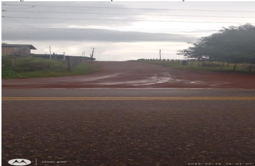
Figure 2- Access road to the Espirito Santo Community: Km 23 on PA 140