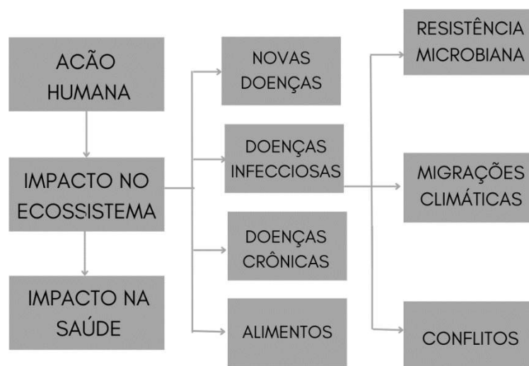
Figure 1 - Flowchart representing the interaction between human activity and its impacts on the ecosystem, affecting human health.

The consequences of these actions on ecosystems act on the process of health, disease, and well-being of humanity, causing the emergence of new diseases, worsening of infectious diseases and increase in chronic non-communicable diseases, deterioration of the current food system with increased hunger and malnutrition, hyper-urbanization, microbial resistance, climate migrations and conflicts over natural resources, among others, according to the Institute of Advanced Studies of the University of São Paulo (IEA-USP). To illustrate these relationships, Figure 1 presents a flowchart that represents the interaction between human activity and its impacts on the ecosystem, which affect human health.