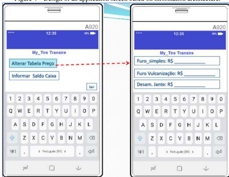
Figure 4 – Design of an application screen based on information architecture.

class the course had six meetings held from 7:30 to 13h on Saturdays. About 80 people participated. The learning reinforcement activities of the course were carried out with the application projects under development by the students themselves. They conducted brainstorming dynamics with the technique of face-to-face design, prototype development, heuristic analysis and usability testing. With this they assimilated with practice the concepts presented in the course. The class showed great commitment and participation during the course and took the opportunity to improve the usability of the applications under development. At the last meeting, each group presented the interface of their applications under development with several improvements in UX.