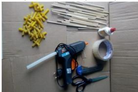
Figure 1: Manipulable materials for experimental practice classes.

For the development of content in mathematics classes, we brought a didactic sequence that first focused on knowing the students' level of knowledge about figures and geometric solids. We noticed that most students have basic knowledge of geometric figures, such as knowing the names and basic properties of some figures. They were also questioned about the applicability of the figures known to them in their day-to-day life, many responded by showing examples of geometric application in the construction of the classroom itself, in the school premises, such as the courtyard, the sports court, etc.