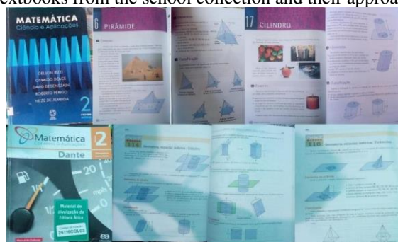
Figure 2: Mathematics textbooks from the school collection and their approaches to geometry content.

Until then, the development of the class went as planned, later we started the mathematical analysis of these figures from the same methodological point of view, resolution, and theorems, as they are found in the textbooks available at the school, both those used in the school year and in the books of the school collection, however, as we will see in the figures below, the books are succinct and direct, which again distanced students from their participation in classes.