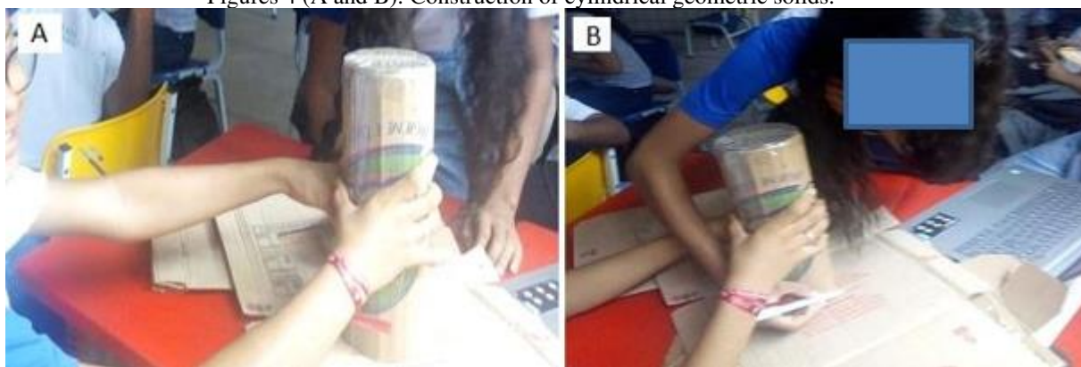
Figures 4 (A and B): Construction of cylindrical geometric solids.

In the figures above, the students build cylindrical shapes with manipulable materials, in this part of the experimental practice classes, these cylinders were produced with sheets of paleo and Durex tape. We lead students to learn the abstract properties of cylindrical and circular geometry, such as radius, diameter, base, and volume as well as generatrix, etc. subsequently, the students demonstrated an understanding of the applicability of the cylindrical shape in everyday life, by associating the properties of this structure with water consumption, cooking gas storage and even medicine containers.