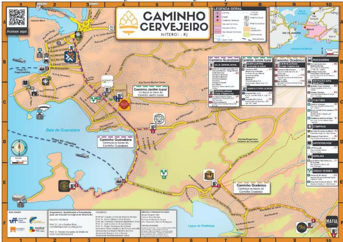
Figure 5: Niterói Brewing Path Map