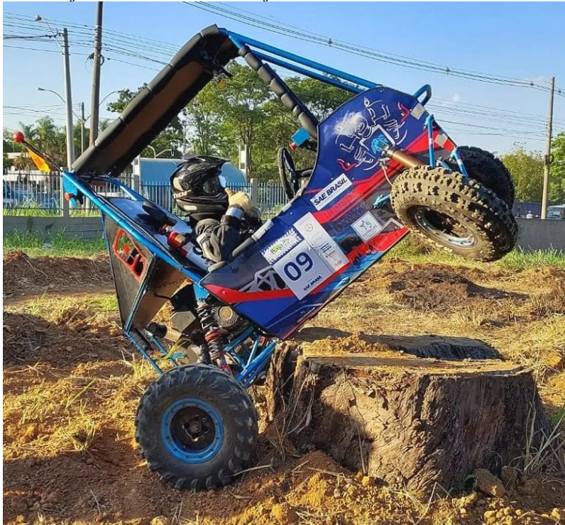
Figure 1 – Baja Vehicle of the TEC-Baja Island SAE Team of the 2022/2023 season

Figure 1 shows the Baja vehicle of the TEC-Baja Island SAE Team for the 2022/2023 season.