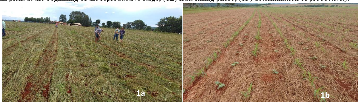
Figure 1 – (1A) implementation of an experiment, (1B) initial phase of plant development, (1C) thawed pumpkin plants; (1D) pumpkin plant at the beginning of the reproductive stage, (1E) fruit filling phase, (1F) determination of productivity.

As for productivity; for pumpkin, it was determined at 82 days after planting, considering all existing fruits in a sample area of 60m 2 (Figure 1F). For corn, it was determined at 115 days after sowing, when the plants were harvested, determining also the length and diameter of the ears, number of grains per ear, number of ears per plant, dry mass per plant (shoot, grains and total), harvest index, grain moisture, weight of 1,000 seeds.