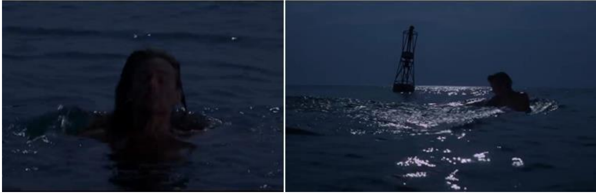
Figure 5: Chrissie being pulled down and dragged by the shark. Rhythmic and delimiting functions