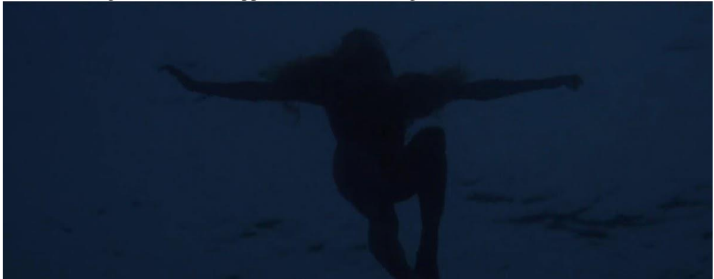
Figure 4: the shark approaches Chrissie's legs. Formant Function