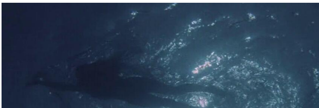
Figure 2: Chrissie's view of the shark's perspective. Formant function.