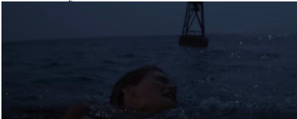
Figure 6: Chrissie is led to her death. Dramatic Function