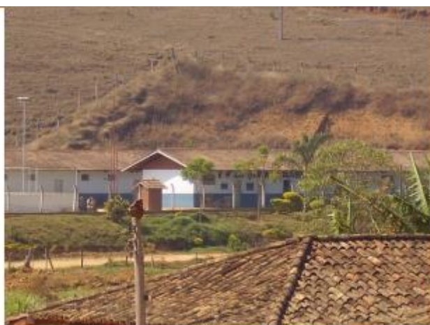
Escola na Comunidade São Pedro de Cima

The Lia Marta Municipal School is a constant stage for our meetings with the community, the fruits of the project are displayed at the school and a neutral place where all children from families of the most varied religions are displayed.