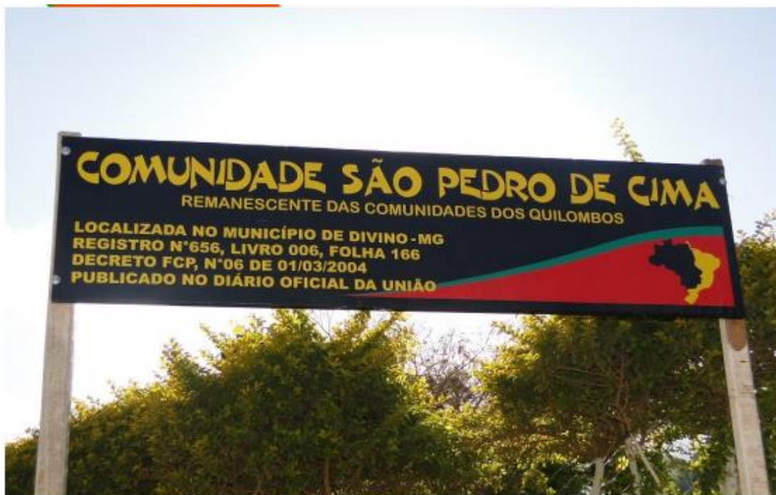
Placa de identificação da comunidade

The Black Avura Movement arises from the demand of teachers and students in order to discover or try to unravel its origins. The movement resists as much as possible, the company Samarco donates musical instruments to Avura and workshops with teachers and students are already planned. The movement works at the school and also has wide participation in the discipline of History of Africa, which is one of the proposals contained in Federal Law 10.639/2003.