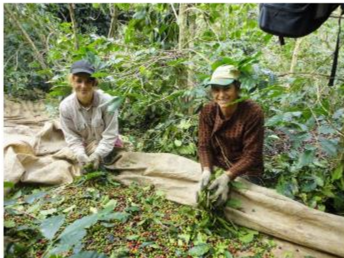
Panha do café

It is worth highlighting an important moment experienced in the last field trips. The last trips were made in July and August, a time when the community turns to the coffee harvest. And, a very important aspect is the massive participation of women at this time, where, in addition to working in their household chores, they participate equally in the coffee harvest.