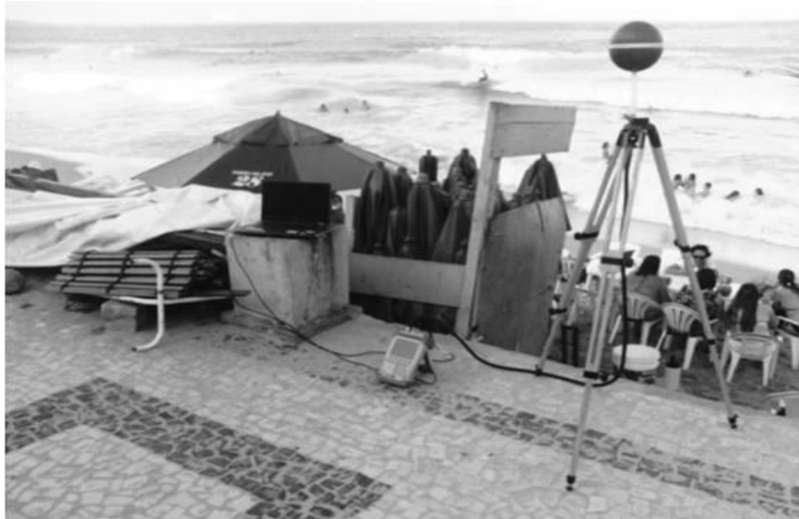
Fig.1-Measurement equipments near a beach in the city of Natal.

Measurements were done preferably at peak mobile telephony times, in order to maximize the probability of getting higher signal levels (10.00 am to 12.30 am and 3.00 pm to 7.00 pm), in far-field zone in 140 outdoor points covering all districts including the main streets and the neighborhoods of Cell Towers (including line of sight points), shopping malls, hospitals and schools, defined basically according to population density criteria. The chosen points are at an average distance of 320 meters from the nearest tower base station. Figure 1 illustrates the measurements equipments. Figure 2 shows the measurement points in Natal City Area.