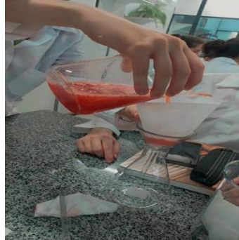
Figure 5: Solution filtering.