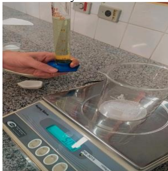
Figure 2: NaCl and alkylbenzene sulfonate solution.