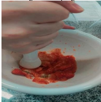
Figure 1: Cutting and steeping of strawberries.