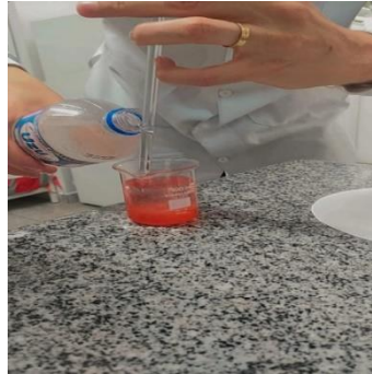
Figure 6: Addition of 100ml of ice-cold 70% alcohol.