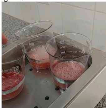
Figure 3: Mixtures in a water bath.