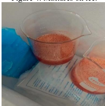
Figure 4: Mixtures on ice.