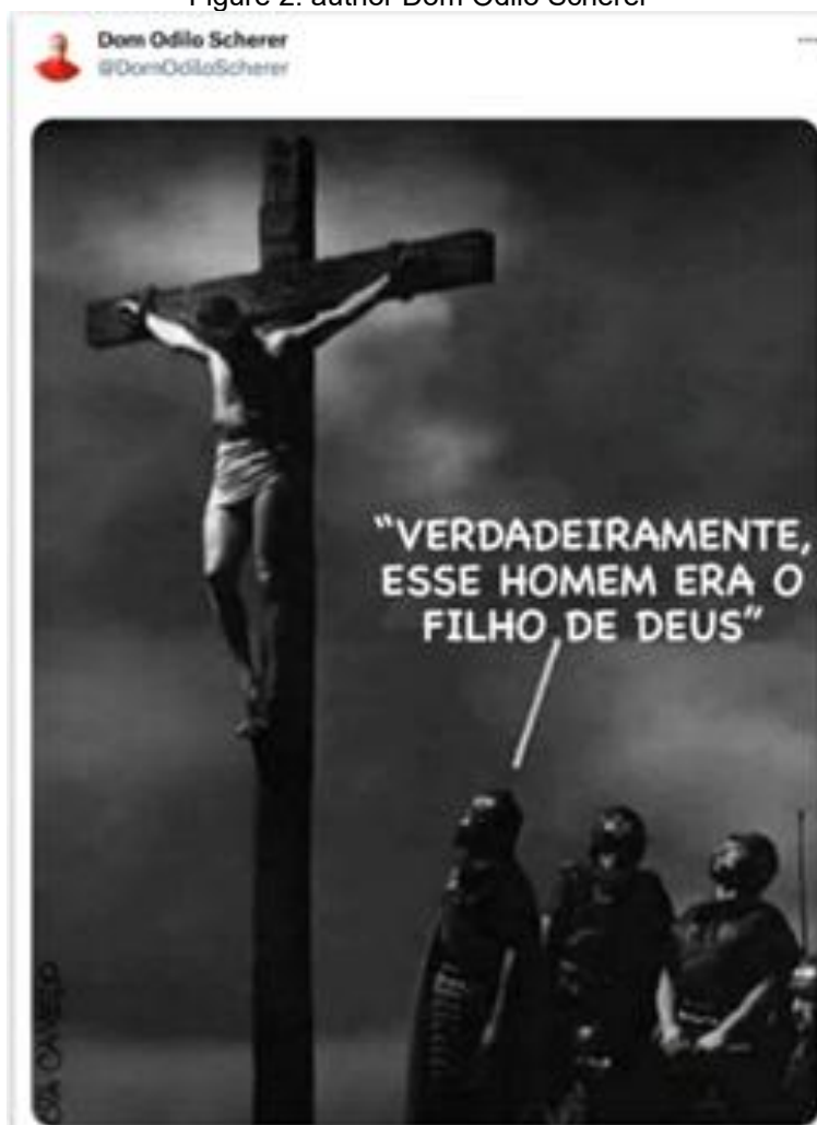
Figure 2: author Dom Odilo Scherer