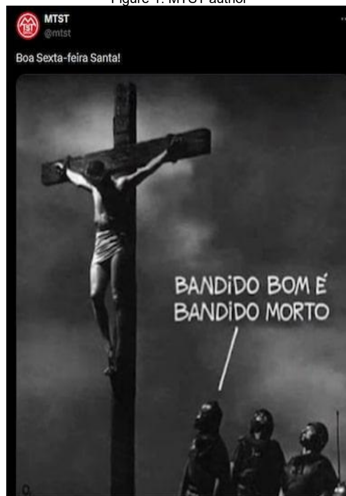
Figure 1: MTST author