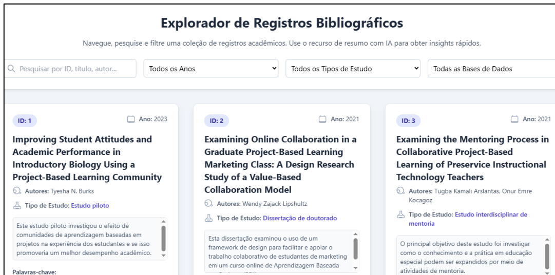
Bibliographic Records Explorer (ERB) interface